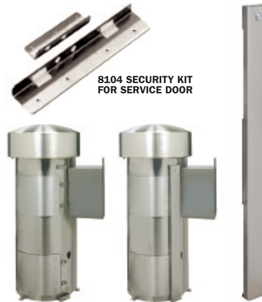
8104 SECURITY KIT FOR SERVICE DOOR

9200 series 9230 series 9270 series 9210 series 9240 series 29000 series 9213 series 9250 series 9220 series 9260 series