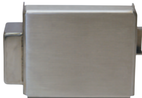
8202W SECURITY COVER FOR COIN BOX

8200 series 9209 series 9500 series 8600 series 9210 series 9200 series 9213 series