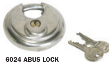
6024 ABUS LOCK