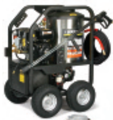
Extra-compact model: 39"L x 28"W x 42"H

These portable, gas-powered, diesel-heated hot water pressure washers are loaded with heavy-duty components and a rugged steel chassis. Their compact frame design along with tubed pneumatic tires provide easy maneuvering in any terrain.